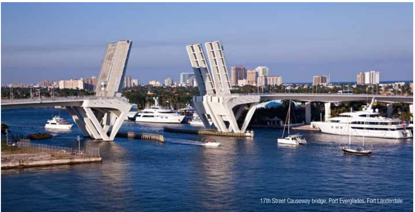
17th Street Causeway bridge, Port Everglades, Fort Lauderdale