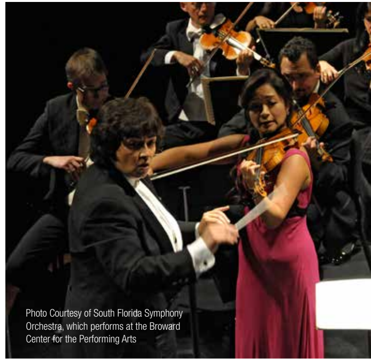
Photo Courtesy of South Florida Symphony Orchestra, which performs at the Broward Center for the Performing Arts

guest speakers from consular groups, trade commissioners and foreign chambers of commerce from China, France, Italy, Mexico, Spain and the United Kingdom.