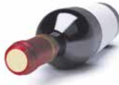
A NICE BORDEAUX